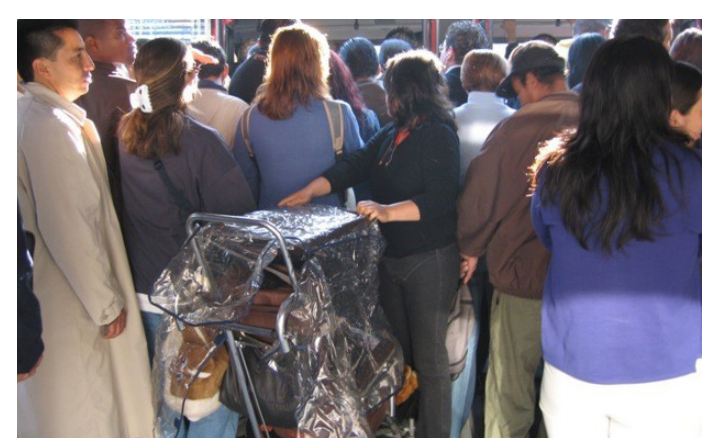
Women with stroller trying to enter bus.

They use public transport and walk more than men and tend to make more off-peak and non-work related trips, traveling to more disperse locations. They are also more likely to trip chain, meaning that when they travel, they tend to have multiple purposes and multiple destinations within one trip. This can be taken into account in the fare structure and the layout of new transportation routes.